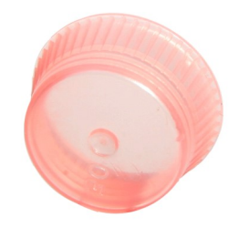
Uni-Flex®Safety Caps for 13mm Culture Tubes, Cat# 6605

"The Premium Tube Cap With The Triple-Lipped Internal Seal!"