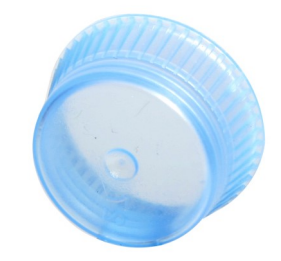
Uni-Flex®Safety Caps for 13mm Culture Tubes, Cat# 6620